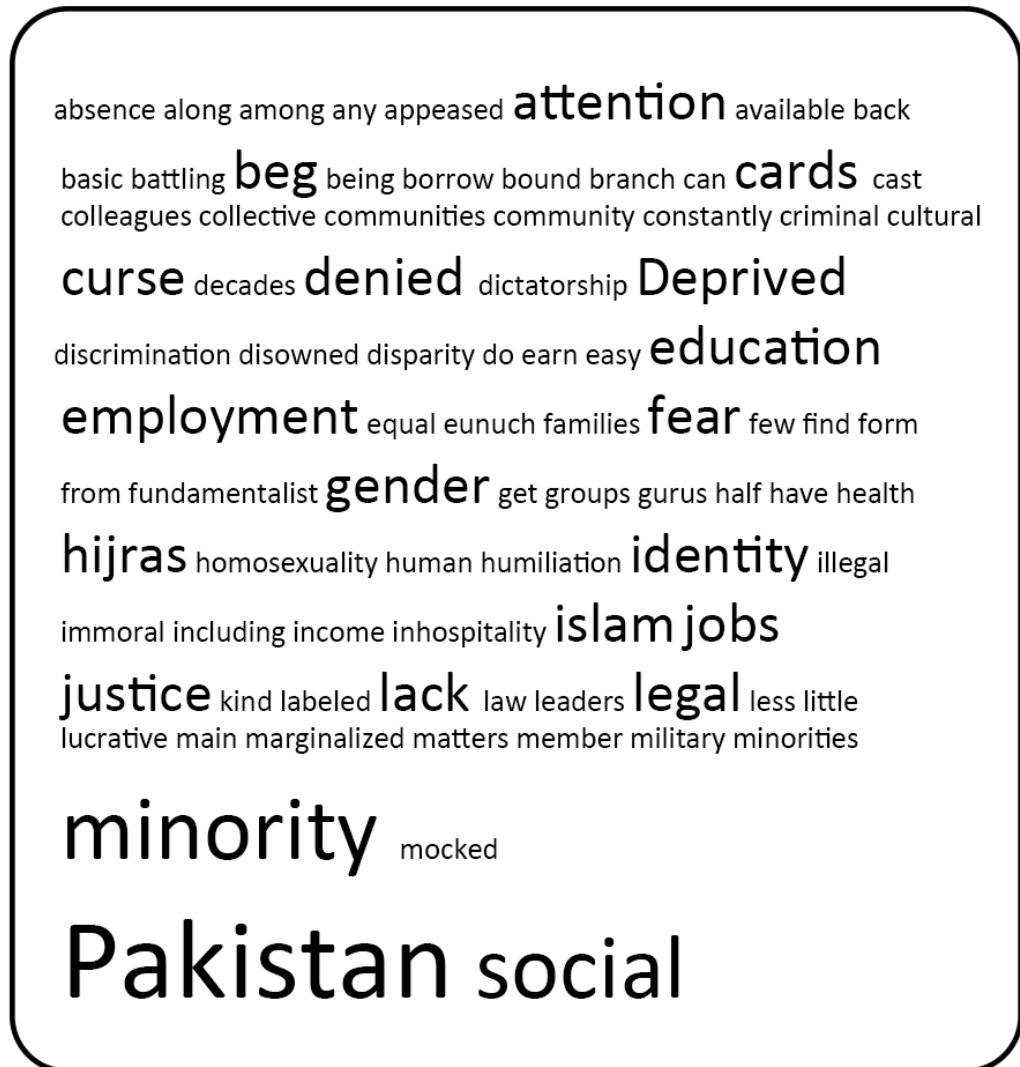
Figure 2. Word Query for Obstacles and Challenges in Transgender Employment.