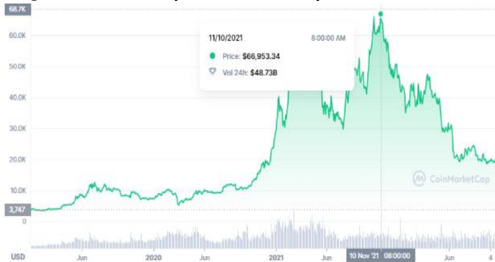
Figure 1: Bitcoin's Daily Price From 1 January 2019 to 31 October 2022

negatively. Therefore, it is crucial for Bitcoin owners to understand the factors that cause Bitcoin to fluctuate.